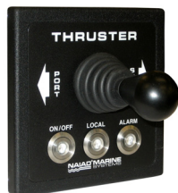
Spring Centered or Put & Stay

Single-stage or fully variable (proportional) controls. Proportional configuration permits the output of the thruster to be throttled by the operator and features a PLC (Programmable Logic Controller) specifically programmed for the application. Controls are housed in a single, durable enclosure for ease of installation. Easily fitted with numerous joystick controls. Most Naiad thrusters are powered by a Naiad Integrated Hydraulic System (IHS). The PLC is easily configured to control many ancillary hydraulic shipboard systems.